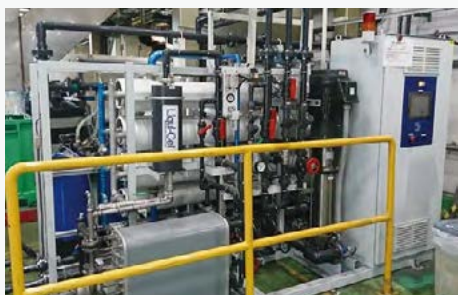
Pure water production facility managed by KWSS

"KWSS" collects remote monitoring and operation data online and conducts water treatment facility operation management and maintenance based on real-time trend management and alarm analysis. By introducing "KWSS," Kurita Chemical Manufacturing Ltd. was able to achieve proper facility maintenance and reclaim and reuse wastewater that was previously discarded from the pure water production facility, which led to a reduction in water intake volume.